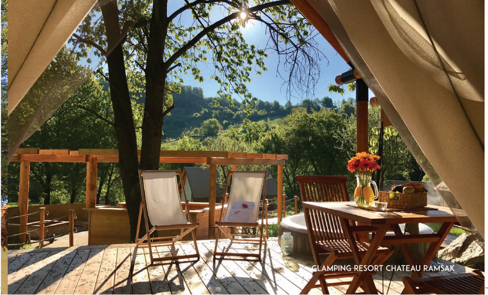
GLAMPING RESORT CHATEAU RAMŠAK