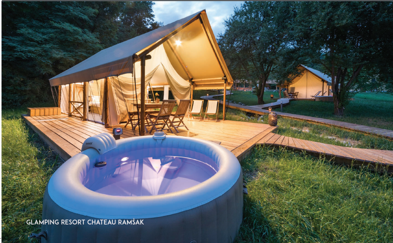
GLAMPING RESORT CHATEAU RAMŠAK