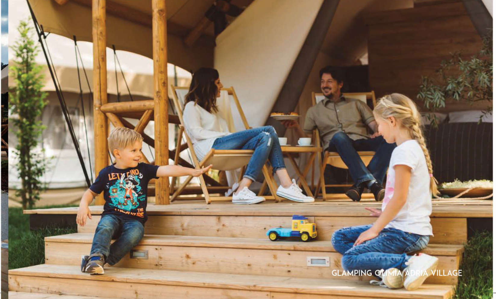
GLAMPING OLIMIA ADRIA VILLAGE