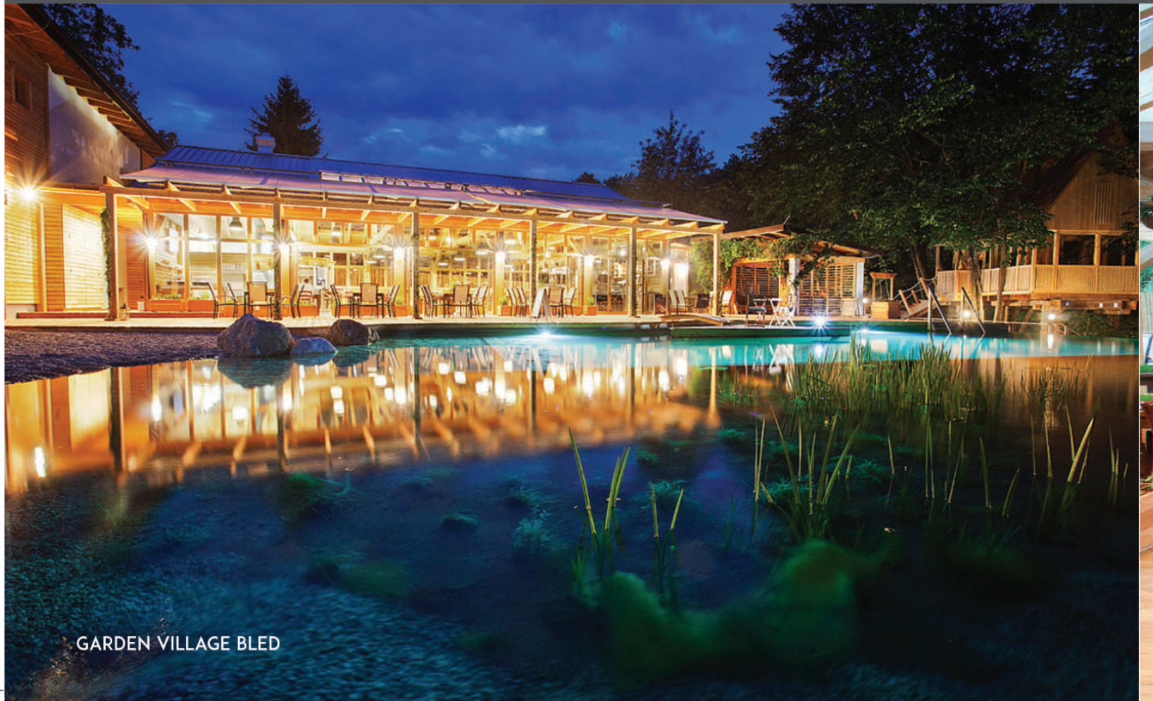
GARDEN VILLAGE BLEĐ