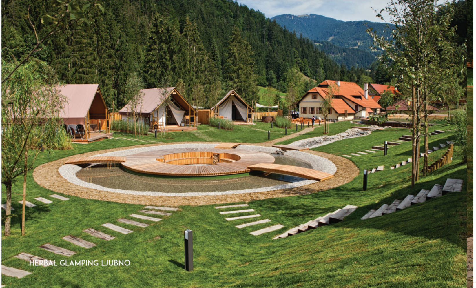
HERBAL GLAMPING LJUBNO