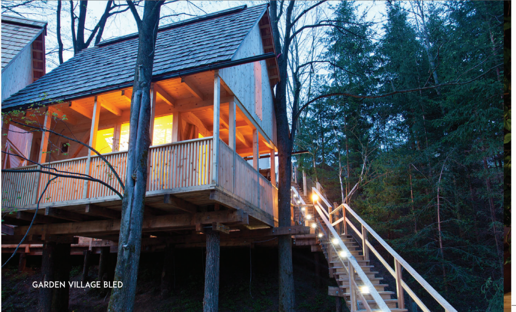
GARDEN VILLAGE BLEĐ