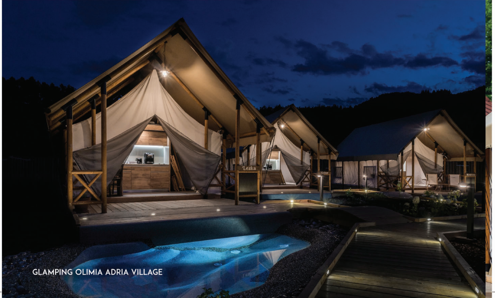
GLAMPING OLIMIA ADRIA VILLAGE