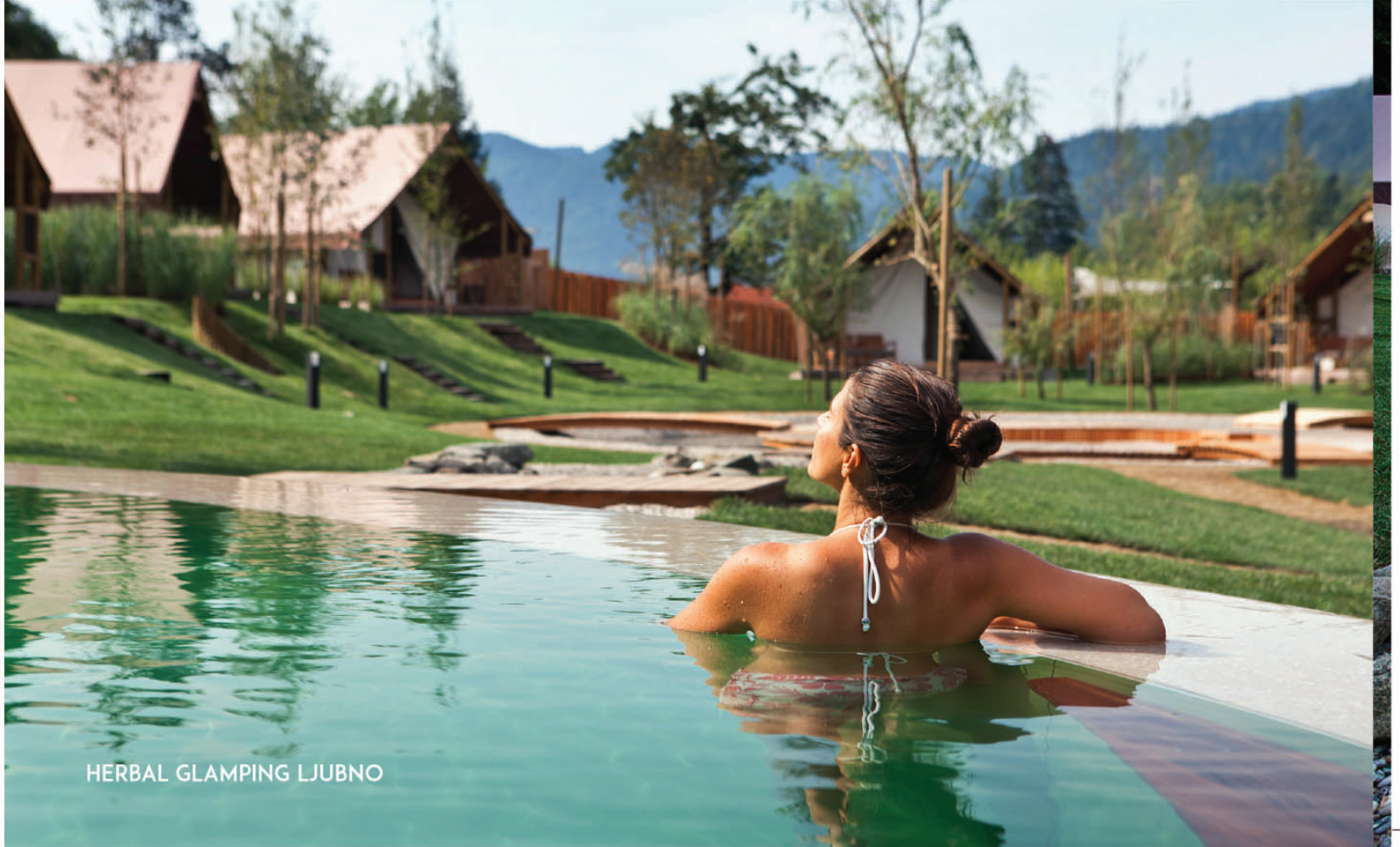
HERBAL GLAMPING LJUBNO