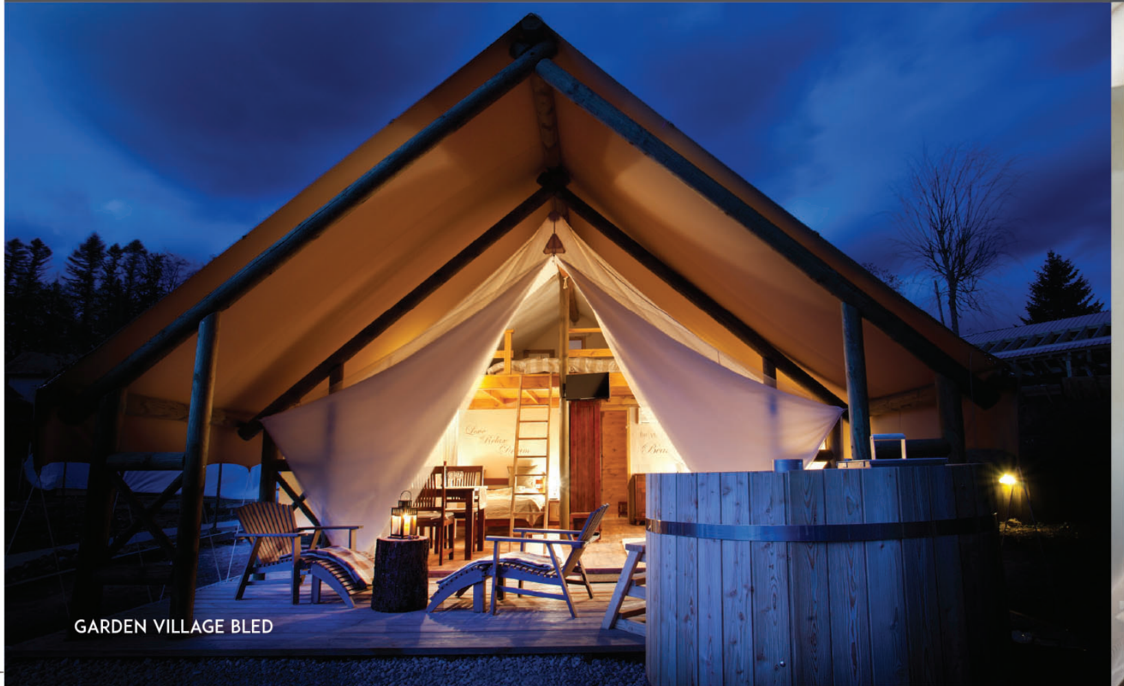
GARDEN VILLAGE BLEĐ