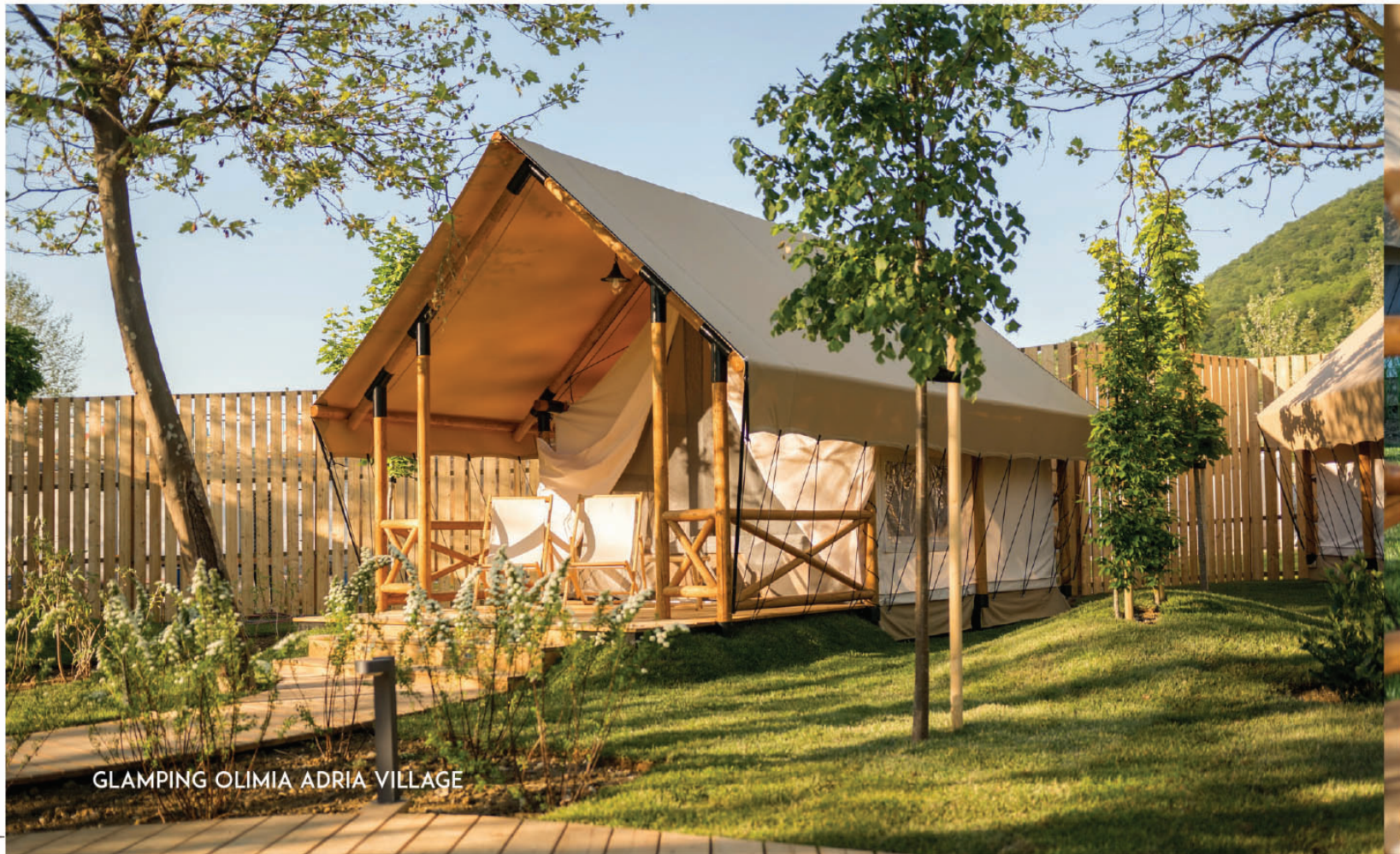
GLAMPING OLIMIA ADRIA VILLAGE