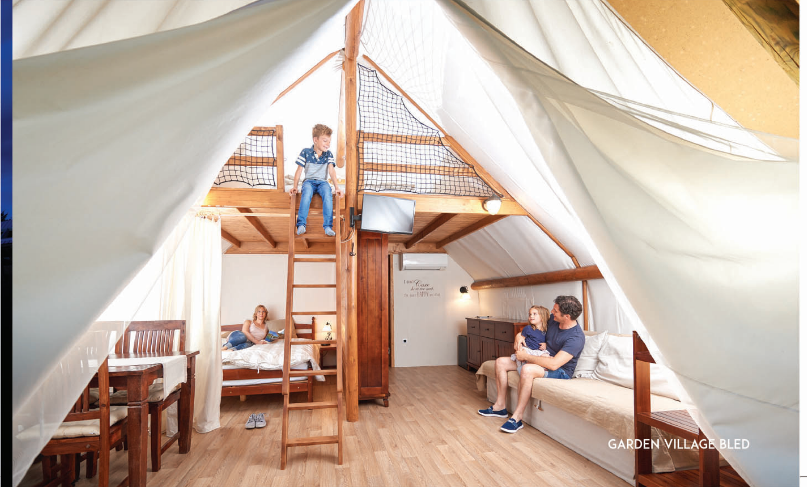
GARDEN VILLAGE BLEĐ