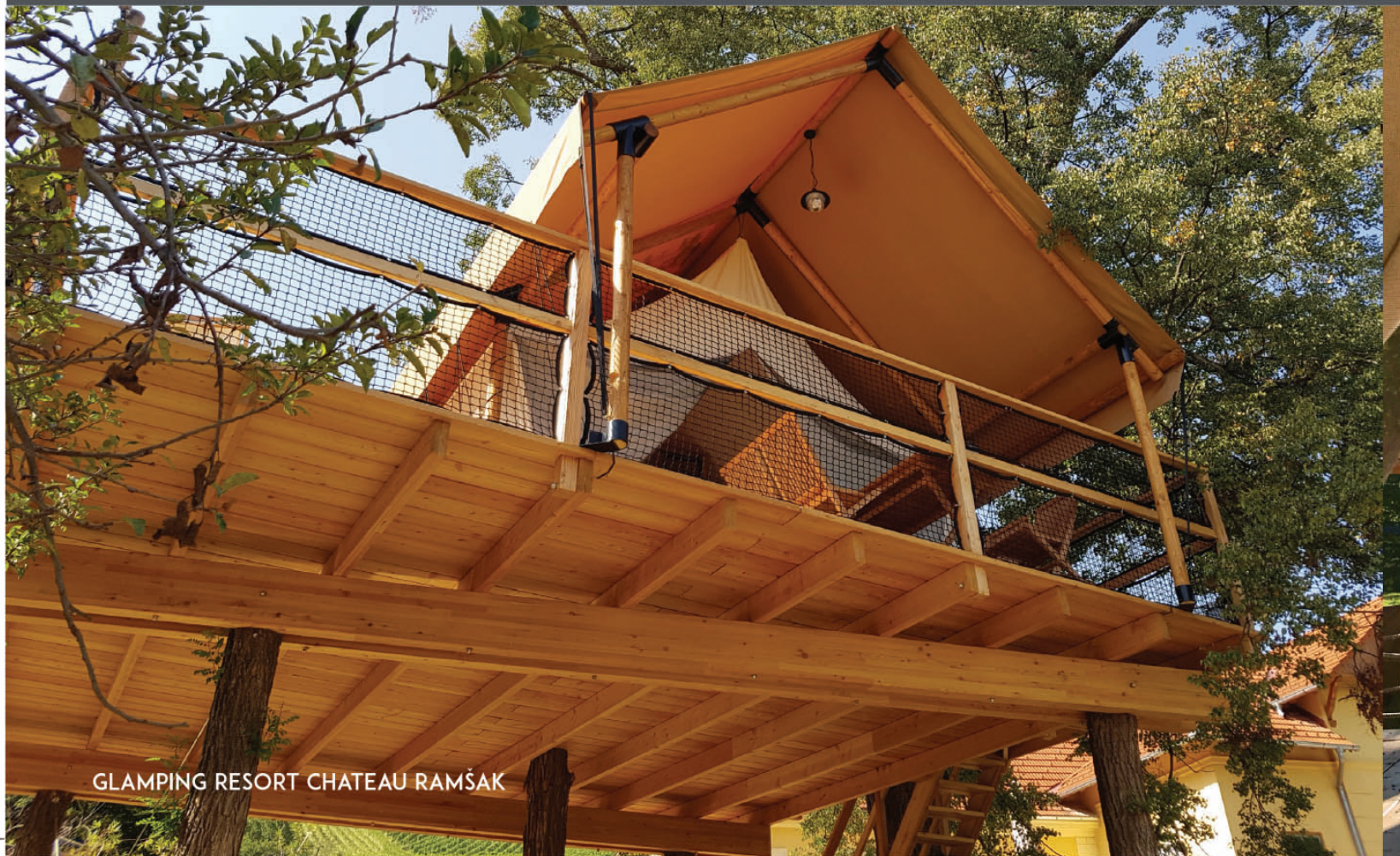
GLAMPING RESORT CHATEAU RAMŠAK