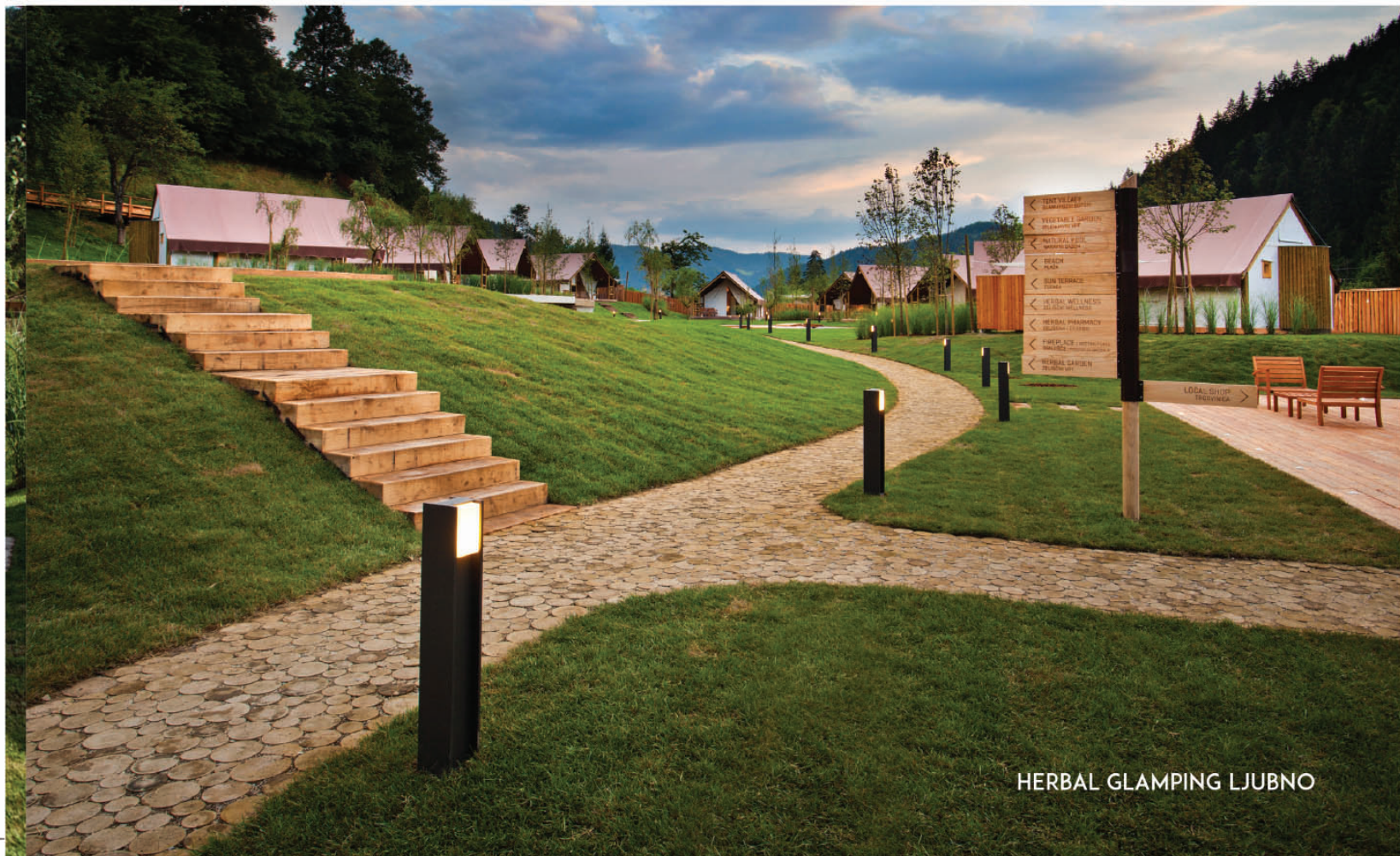
HERBAL GLAMPING LJUBNO