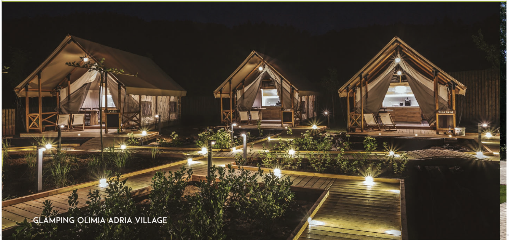
GLAMPING OLIMIA ADRIA VILLAGE

Located at the world famous Olimia thermal spa resort, thermal water and spa are what this superb glamping site is all about. The thermal stream and private natural whirlpool guarantee an exceptional experience, while the nearby aqua park and spa facilities provide additional entertainment options and promise fun for the whole family.