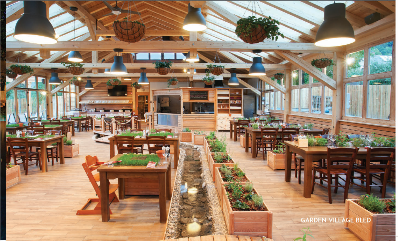
GARDEN VILLAGE BLEĐ