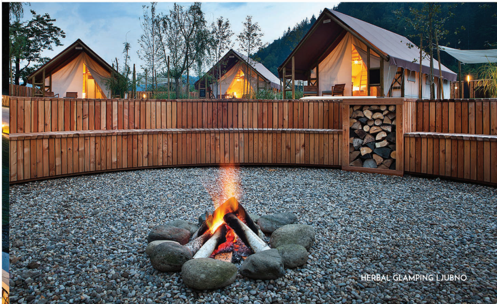
HERBAL GLAMPING LJUBNO