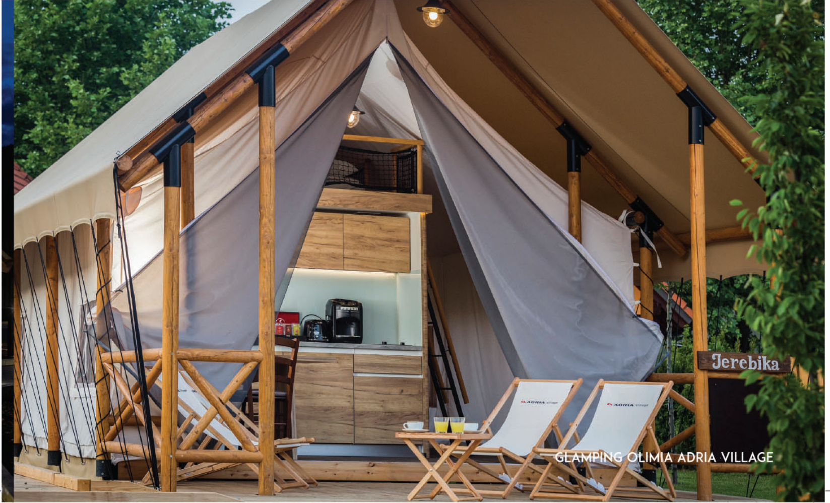
GLAMPING OLIMIA ADRIA VILLAGE