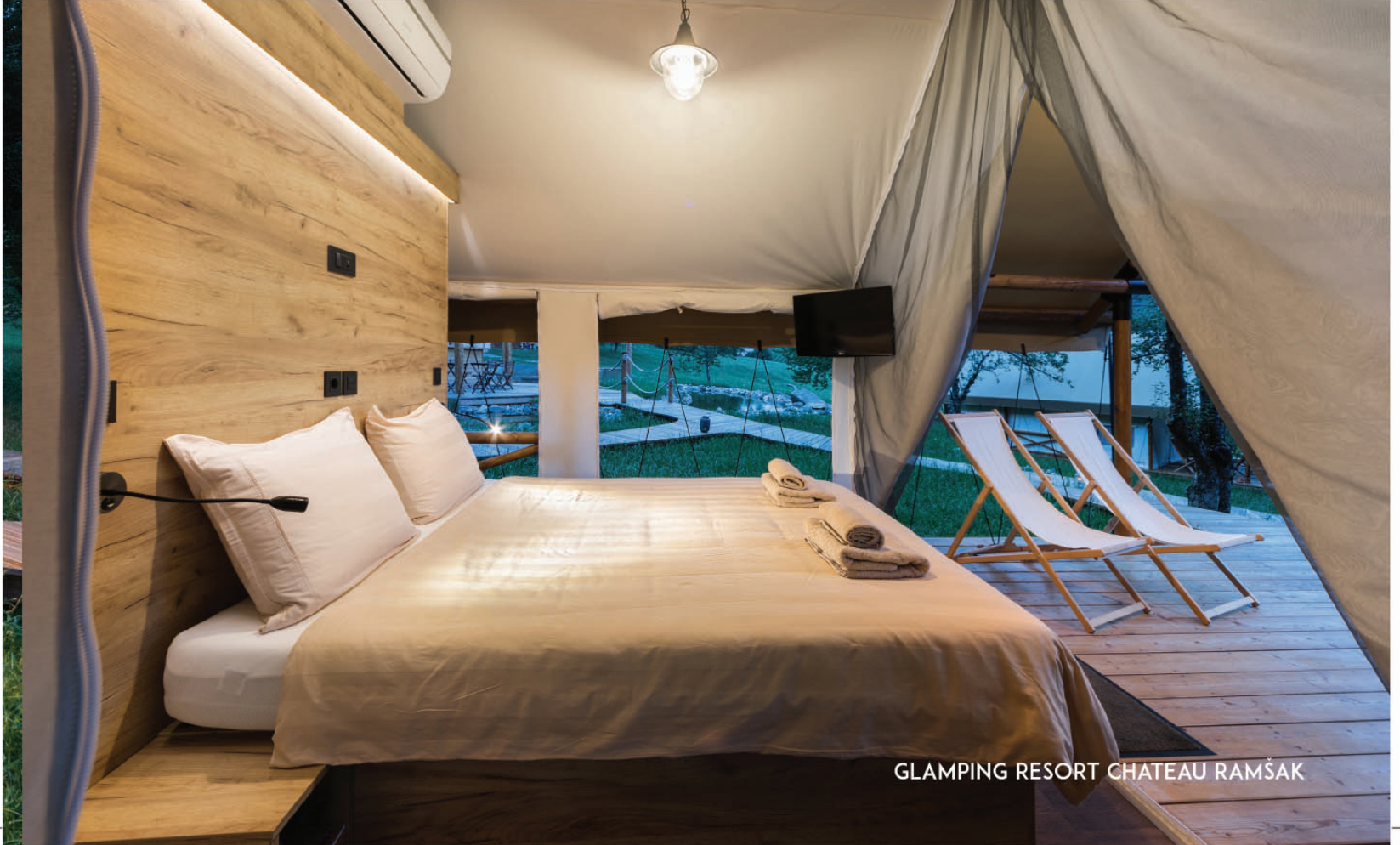
GLAMPING RESORT CHATEAU RAMŠAK