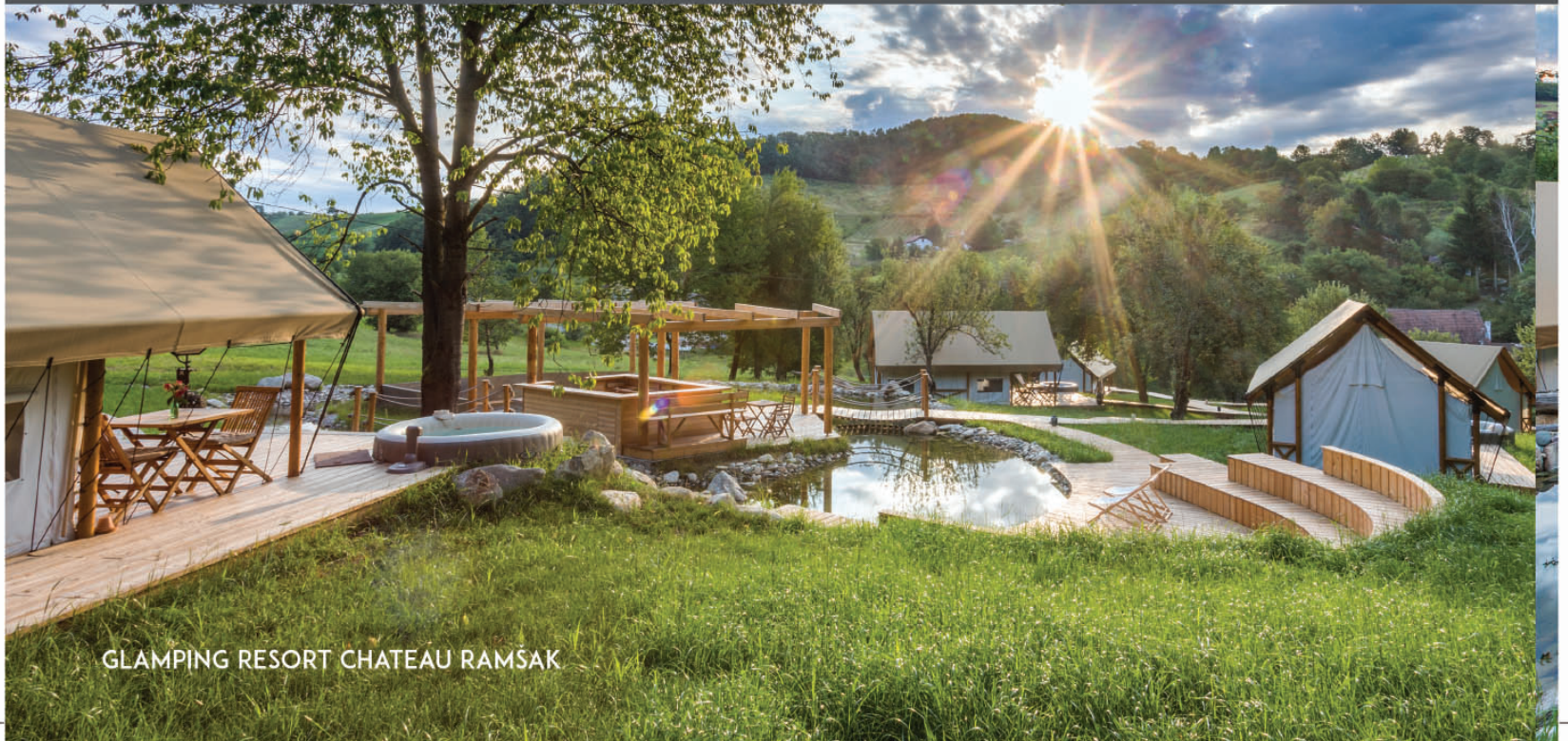
GLAMPING RESORT CHATEAU RAMŠAK

Located in the picturesque wine region of Styria, the main theme of the resort is, of course, wine and vineyards. Thoughtfully designed tents and a tree house with a wonderful view of the vineyard and its surroundings provide a truly relaxing experience – whether it means enjoying a small bar by a natural pond, or tasting the exquisite wines of the Ramšak Estate.