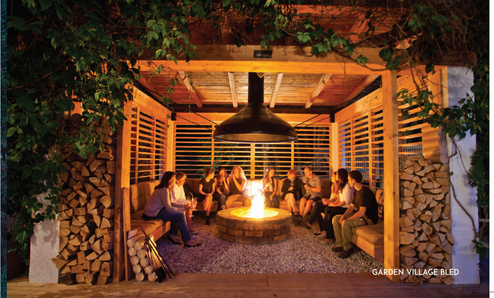
GARDEN VILLAGE BLEĐ