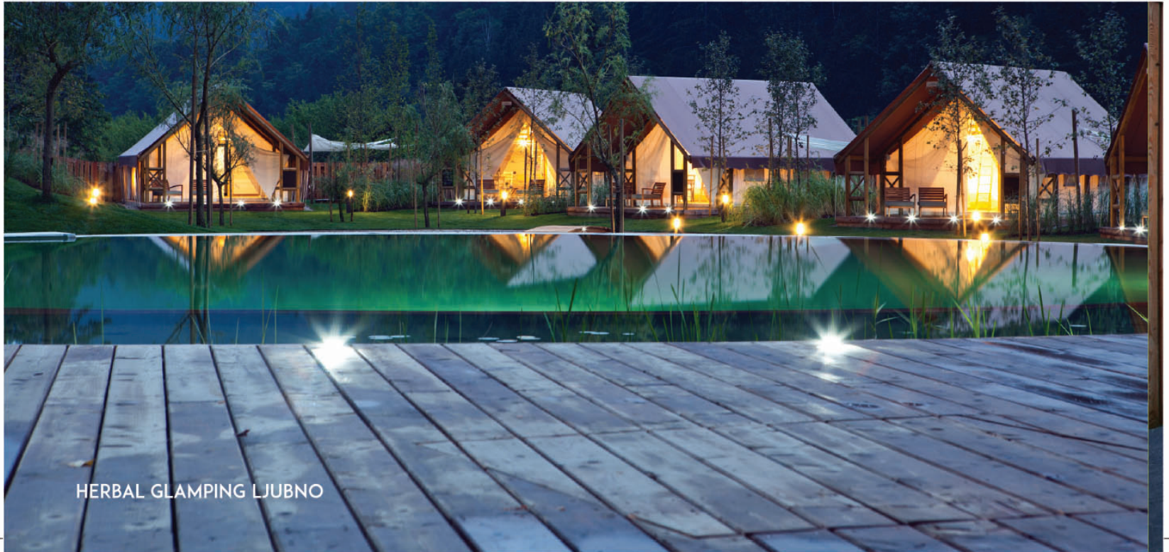
HERBAL GLAMPING LJUBNO

With the theme of the resort being herbs and aromatic plants, all the details follow this concept. Thematic workshops and herbal pharmacy look for themes and inspirations in our own herbal and vegetable garden.