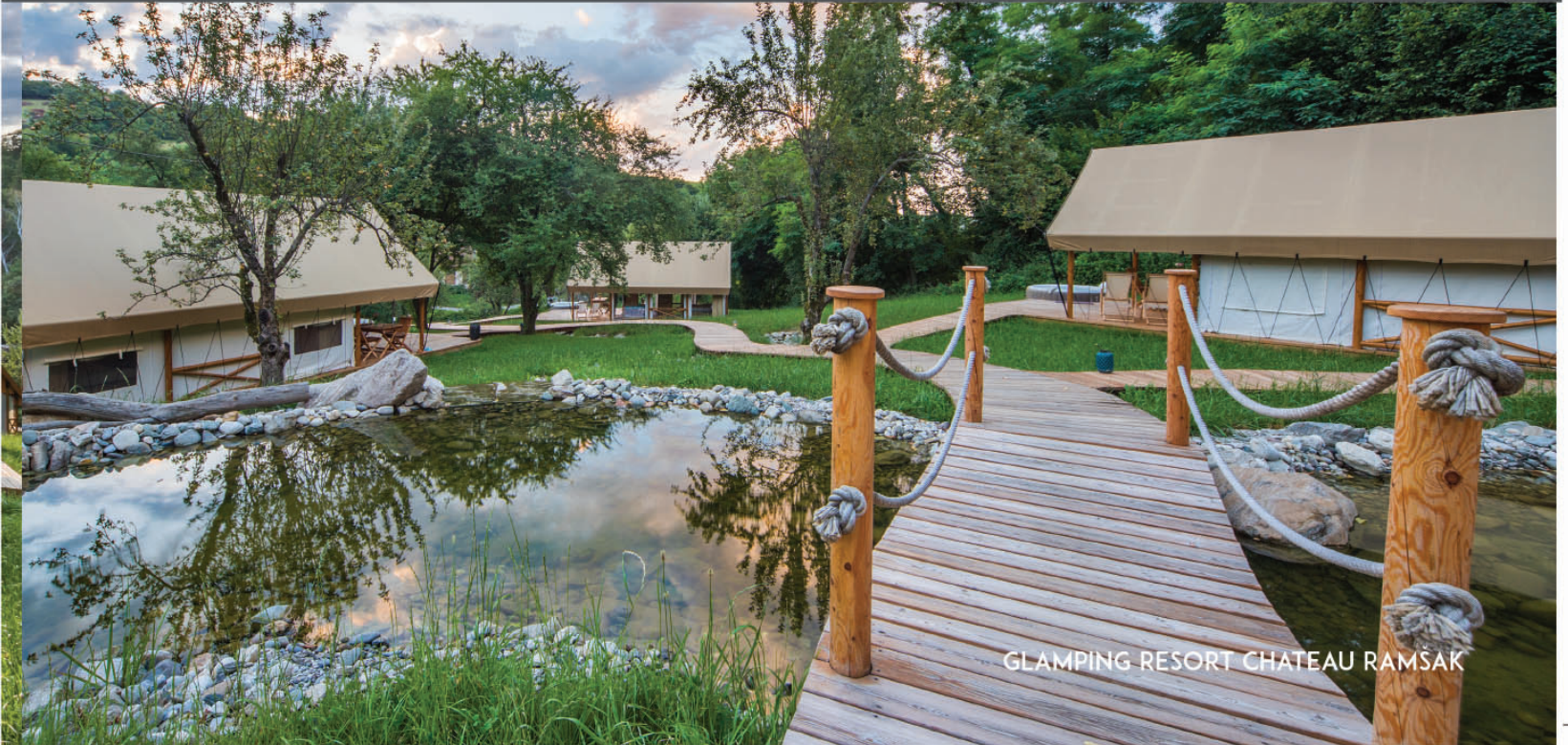
GLAMPING RESORT CHATEAU RAMSAK